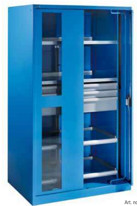
Art. no. 59.553.010 Light blue, RAL 5012

with retracting solid sheet or viewing window doors