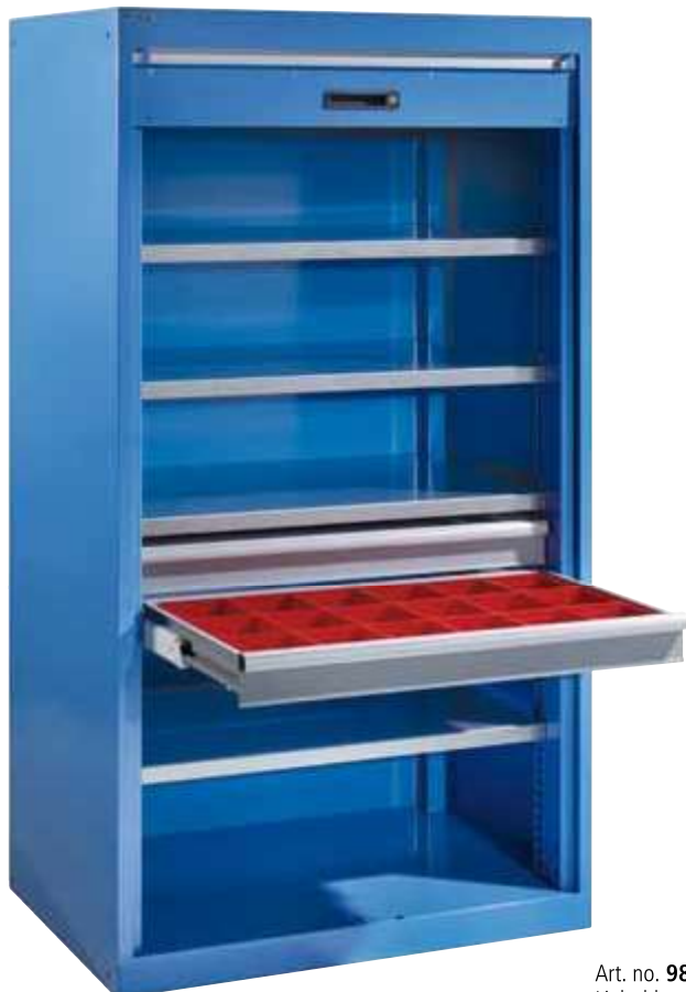
Art. no. 98.091.010 Light blue, RAL 5012 (excluding partition material)

641 200/160 Key Lock - 98.095.XXX 200 drawers / pull-out shelves 160 adjustable shelves