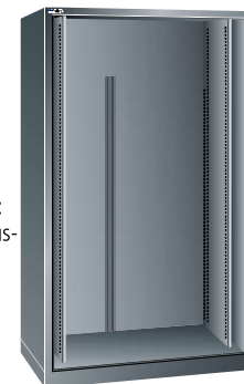
Housing for 2 retracting doors

Max. installation height for drawers and pull-out shelves: 1400 mm of the housing opening.