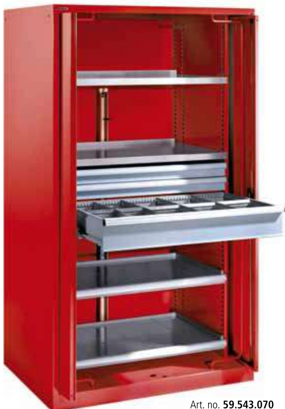
Art. no. 59.543.070 Ruby red, RAL 3003 (excluding partition material)