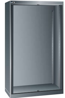
Housing for 2 hinged doors/ roller shutter

Max. installation height for drawers and pull-out shelves: 1400 mm of the housing opening.