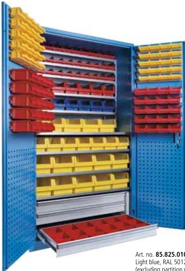
Art. no. 85.825.010 Light blue, RAL 5012 (excluding partition material)

➤ For open-ended containers see pages 452/453