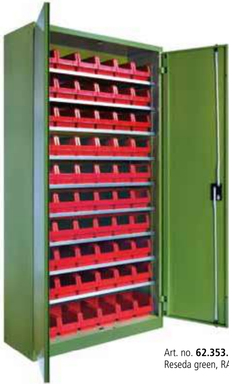
Art. no. 62.353.030 Reseda green, RAL 6011

Lista container cabinets are especially suited for storing storage containers on adjustable shelves. The cabinet specification is based on the hinged door cabinets in proven Lista quality.